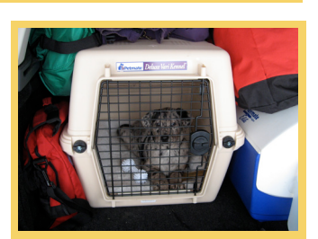
Make Sure Crates Fit In Transport Vehicle