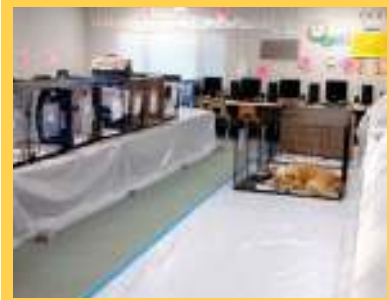
Emergency Animal Shelter - 2013 Carstens Fire. Sheltered 48 small companion pets in Mariposa, CA

The CCADT deploys to disasters in Fresno, Kings, Madera, Tulare, Merced and Mariposa counties*